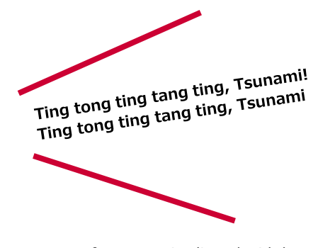
**Language of message is aligned with language setting.